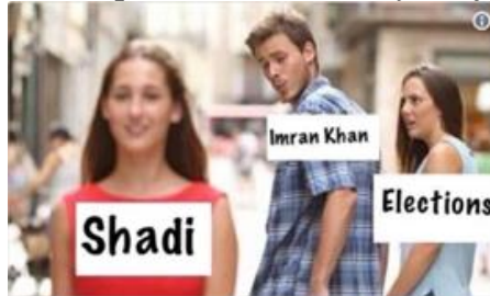
Image 1: Narrative, Process, Actional, Reactional, Transaction & Non-Transactional; Conceptual, Symbolic