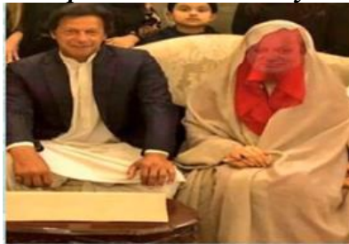
Image 3: Representation, narrative, circumstances, locative, accompaniment; conceptual, symbolic

The third selected image in the context of Khan’s marriage is a political satire. Although it seems as if he is getting married with Bushra Bibi yet he might have engaged himself in a deal with Nawaz Sharif, the former Prime Minister of Pakistan, because Khan’s ultimate goal is to become a prime minister. This is quite evident from the election results of 2013 and senate elections of 2018 in which Imran Khan did not succeed in getting strong position in the parliament. Therefore, the only way to prime minister house can be an unholy alliance with Nawaz Sharif.